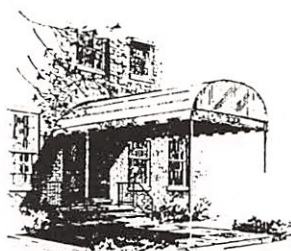
THE VAN DYCK 237 Union Street