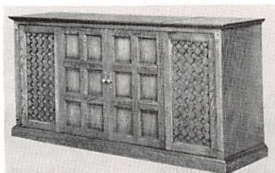
THE FISHER FUTURA Mediterranean, in Oak

FULLY-TRANSISTORIZED • 75 WATTS • FM-STEREO-MULTIPLEX WIDE RANGE AM • 4-SPEED AUTOMATIC TURNTABLE 2 AND 4-TRACK, STEREO/MONO TAPE RECORDER† TWO THREE-WAY SPEAKER SYSTEMS