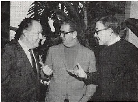
... you've got to have a dream ...