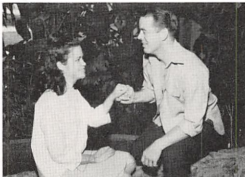
... younger than springtime ...