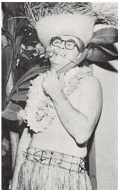
... 101 pounds of fun ...