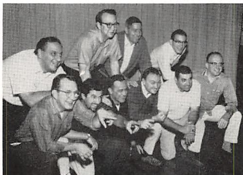
what ain't we got ...