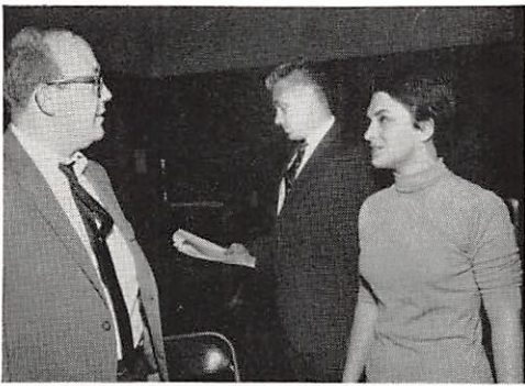
... nothing like a dame ...