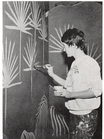
... Bali ha'i ...