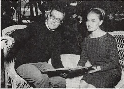
... happy talk ...