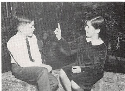
... pourquoi ...