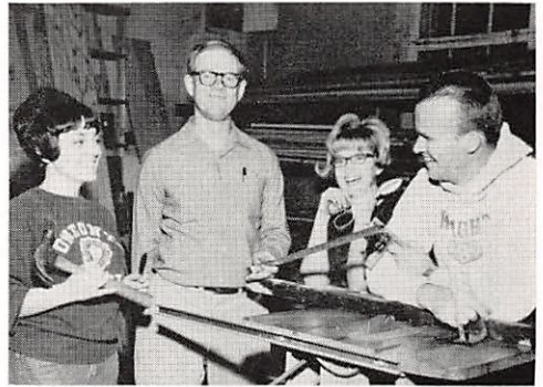
... (?) things you like to do ...