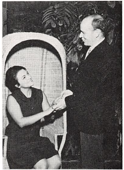
... enchanted ...