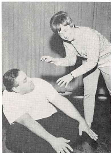
... cockeyed optimist ...