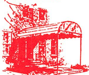
THE VAN DYCK 237 Union Street