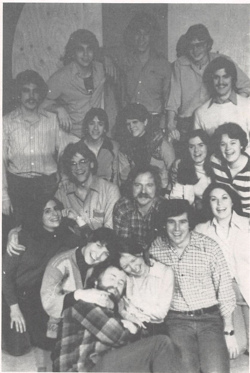
Apple Tree Cast and Director