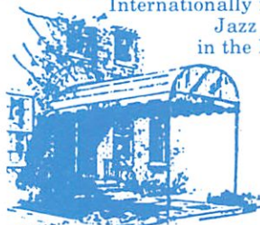
THE VAN DYCK 237 Union Street

Internationally famous Jazz Artists in the Lounge