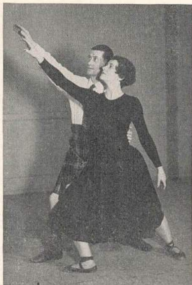
Bonnie Jean Ballet