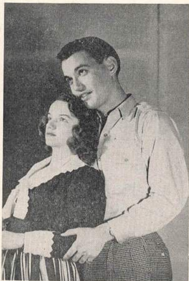
Heather on the Hill