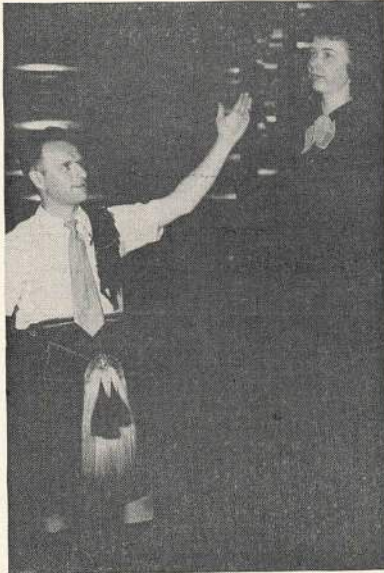
I'll Go Home With Bonnie Jean