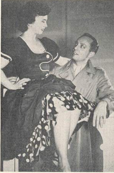
The True Love of My Life